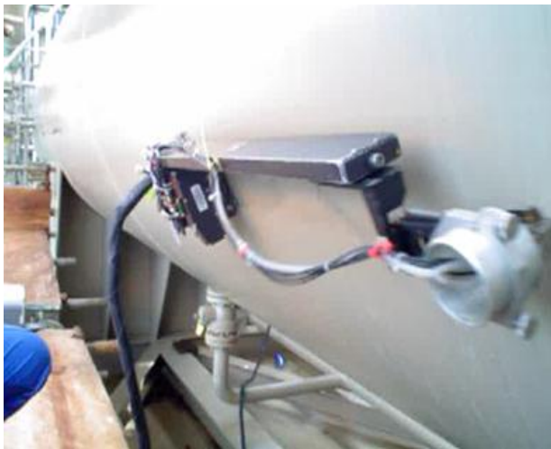
New state-of-the-art AUT system (below) & scanner specially designed to withstand high temperatures (above), enhance the productivity and performance of on-stream inspections.

I will also discuss latest technologies such as Phased Array and how integrating phased array techniques into the inspection completes the process.