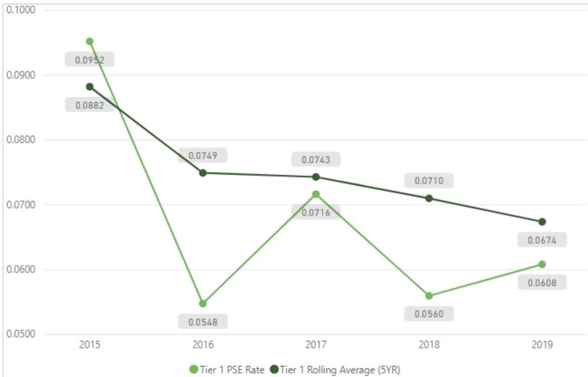
Figure 1. U.S. Refining Tier 1 PSE Rates (2015-2019)