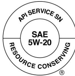
Figure 2—API Service Symbol

Service Categories are used in the upper portion of the API Service Symbol to identify specific engine oil performance levels. The API Service Symbol may be licensed for use with passenger car motor oils, diesel engine oils, or both as long as the oils meet the performance requirements of an appropriate API Service Category or Categories. Currently, the API Service Categories that may be included in the API Service Symbol are SN, SM, SL, SJ, SH (when preceded by a C category) , CH-4, CI-4, and CJ-4. On December 1, 2016, CK-4 and FA-4 may be included in the Service Symbol (note that FA-4 cannot appear in the API Service Symbol with any C Service Category). Oils that meet API CI-4 licensing requirements are also authorized to display CH-4 in the API Service Symbol. Oils that meet API CJ-4 licensing requirements are also authorized to display CI-4 with CI-4 PLUS, CI-4, and CH-4 in the API Service Symbol. On December 1, 2016, oils that meet API CK-4 licensing requirements are also authorized to display CJ-4, CI-4 with CI-4 PLUS, CI-4, and CH-4 in the API Service Symbol. SAE 0W-16 and 5W-16 oils may only be licensed as API SN.