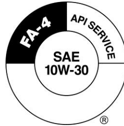
Figure 6—API Service Symbol “Donut” with API FA-4

7.3.3 API Service Symbols may appear as black and white, reversed out, or in color. Examples of acceptable designs are provided in Figures 7 and 8. Any color is acceptable provided the design conforms to the designs shown in Figures 5 through 8.