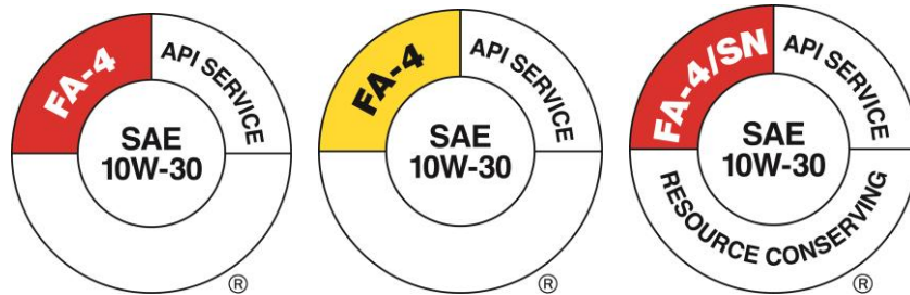
Figure 7—Representative Examples of the API Service Symbol with FA-4

7.3.3 API Service Symbols may appear as black and white, reversed out, or in color. Examples of acceptable designs are provided in Figures 7 and 8. Any color is acceptable provided the design conforms to the designs shown in Figures 5 through 8.