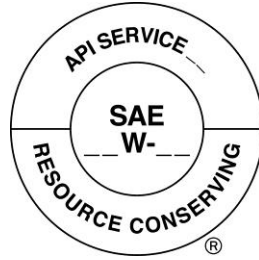
Figure 5—API Service Symbol “Donut”