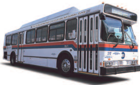
Fueled by natural gas.

When you stop and think about it, it's amazing how many things get their start from oil and natural gas. Comfy synthetic fabrics we wear year-round. Medicines that make us feel better. Transportation fuels that help us get around. Fertilizers that help our gardens grow. And just about every toy we play with.